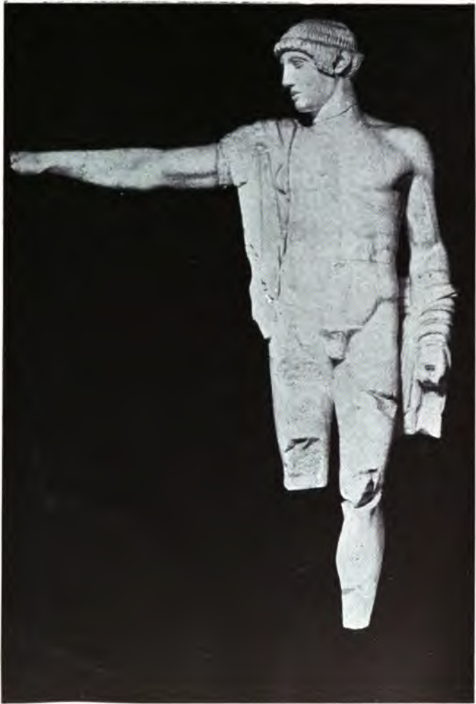
Fig. 14. Apollo, from Olympia.